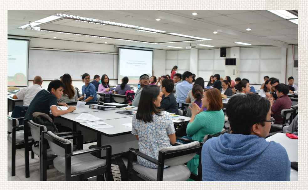
Teaching Effectiveness Course

academic, personnel, and community concerns, with a view to empowering our students, faculty, REPS and staff. The recent establishment of the REPS Welfare Council is an important step toward the meaningful participation of REPS in campus governance. I will continue to support such initiatives.