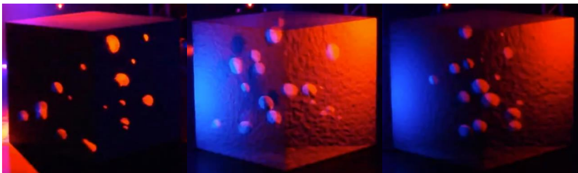
Fig. 3: Frames of a video with 2:1 aspect ratio projected across 2 faces