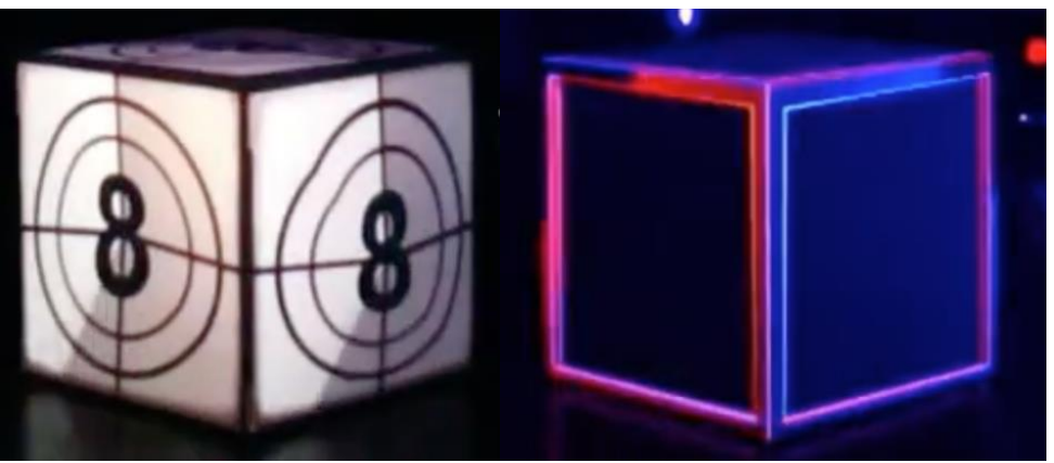
Fig. 2: Sample videos with 1:1 aspect ratio projected on 3 faces, tiled

There are two possible aspect ratios for the videos: 1:1 for one face (see Fig. 2) or 2:1 for two faces (see Fig. 3).