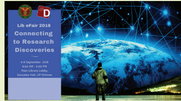
Cover design from UP Main Library

Ugnayan Unibersidad ng Pilipinas Diliman (Ugnayan) is a publication of the UP Diliman Information Office under the Office of the Chancellor, UP Diliman. Its editorial office is located at 2/F University Theater (Villamor Hall), Osmeña Avenue, UP Diliman, Quezon City, with telephone numbers 981-8500 loc. 3982/3983, email address upd.ugnayan@gmail.com .