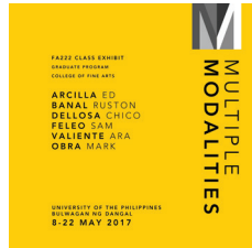
Cover design by FA 222 class

Ugnayan Unibersidad ng Pilipinas Diliman (Ugnayan) is a publication of the UP Diliman Information Office under the Office of the Chancellor, UP Diliman. Its editorial office is located at 2/F University Theater (Villamor Hall), Osmeña Avenue, UP Diliman, Quezon City, with telephone numbers 981-8500 loc. 3982/3983, email address upd.ugnyan@gmail.com .